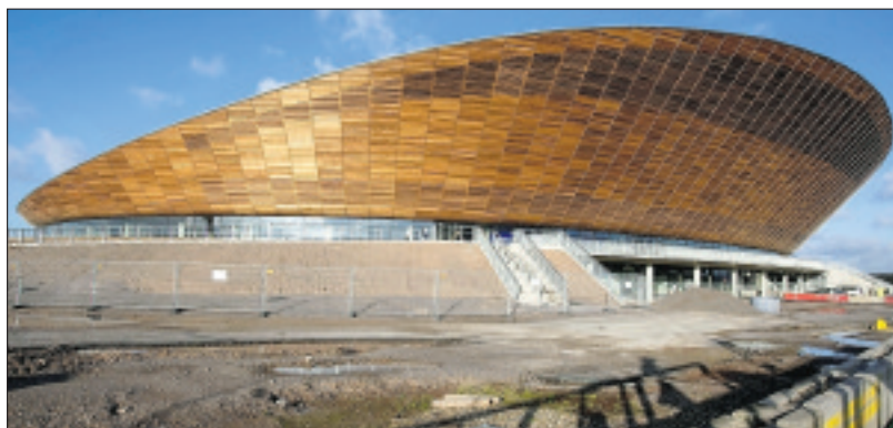
THE WHEEL DEAL: An outside view of the velodrome and Sir Chris Hoy cycling around the track

READ THE FULL STORY IN THIS WEEK'S NEWHAM RECORDER.